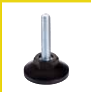
ADJUSTABLE FOOT fitted to linking screen