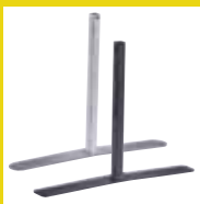
METAL FEET in silver or graphite fitted to freestanding screens