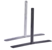
(Metal feet silver or graphite)