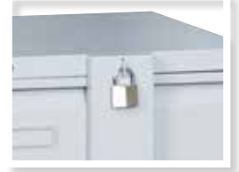
Locked with padlock (not included)