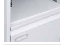
Steel dividing sheet